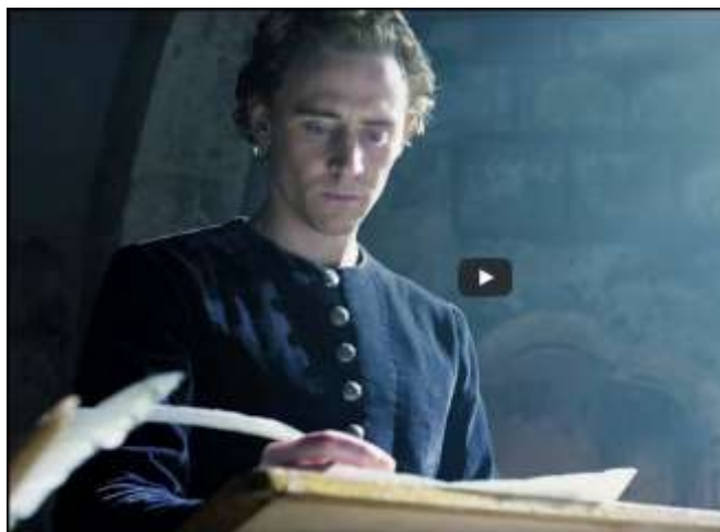
Listen to Tom Hiddleston read Invictus

It matters not how strait the gate, How charged with punishments the scroll, I am the master of my fate, I am the captain of my soul.